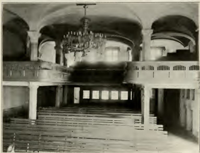
INTERIOR STOCKHOLM MISSION HOUSE, LOOKING TOWARDS THE GALLERY